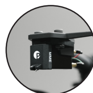
Pick it MM E